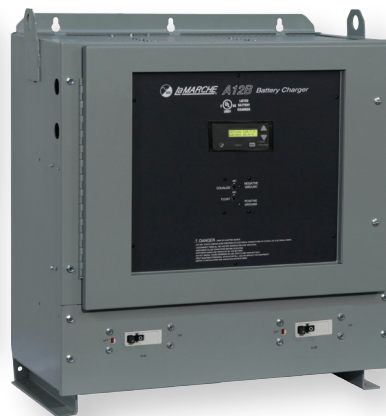
46 Series CAP W/Breakers