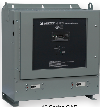
16 Series CAP W/Breakers