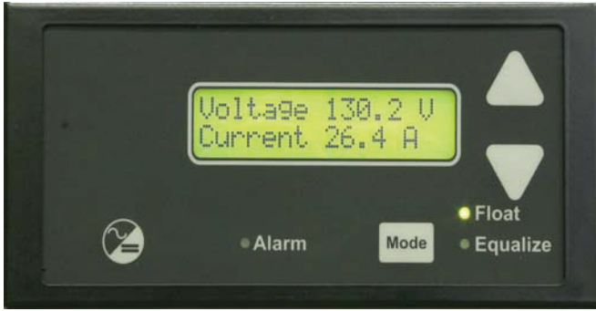
46 Series (LCD)

Case sizes may differ depending on optional accessories and / or 50Hz input. Please consult factory when dimensions are critical. Dimensions shown above are overall footprint. Detailed dimensions drawings are available for mounting purposes.