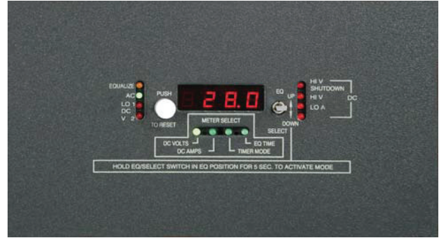
16 Series (LED)

Refer to Digital C.A.P. System Data Sheet for complete details. Discrete alarm LEDs available.